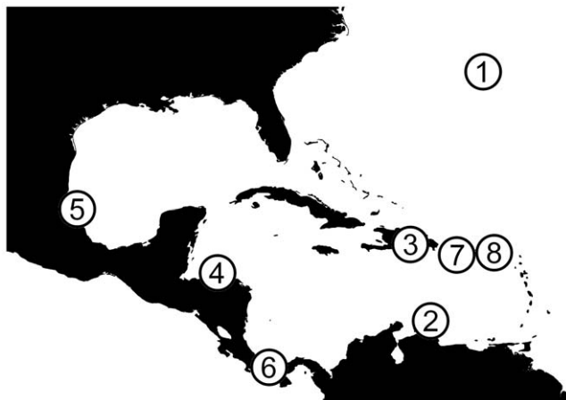
Figure 1. Map of sampling locations for AFLP analysis of Hypoplectrus morphotypes. 1 = Bermuda, 2 = Curaçao, 3 = Dominican Republic, 4 = Honduras, 5 = Mexico, 6 = Panama, 7 = Puerto Rico, 8 = U.S. Virgin Islands.

Samples were collected using SCUBA, from coral reef sites at eight sampling locations (i.e. countries) distributed across the Caribbean basin (Fig. 1). We refer to all individuals of a particular colour form at a particular location as a ‘morphotype population’ and all individuals of a particular colour form from throughout the Hypoplectrus distribution as a ‘global morphotype population’. Fish were sampled by using micro-spears or “hook and line” whereby baited, barbless hooks were offered to fish. Hooked fish were released after fin clipping. Fin clips were removed from the dorsal and anal fins and placed in ethanol and stored at 4°C. The morphotypes sampled and number of individuals collected varied among locations, depending on local abundance (Table 1).